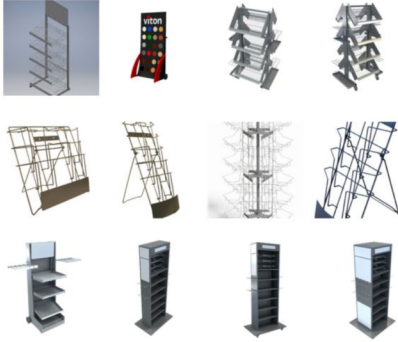
Sample of products